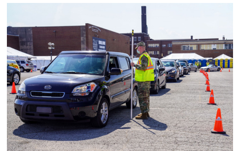
FEMA mass vax site, Roosevelt Park, Gary, IN